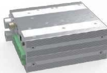
DC Control Box