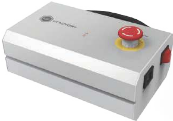
AC Control Box